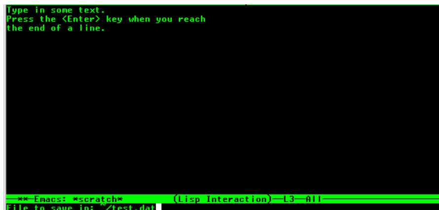
Figure 3 Saving Your File

The first time you give this command, Emacs will ask you to give the name of the file. You should enter the file name as shown below and press <Enter>.