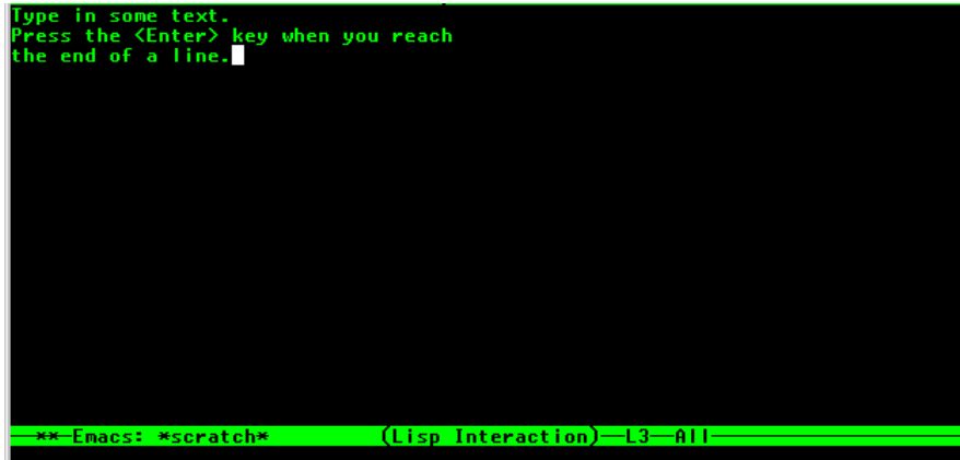
Figure 2 Entering Text

To To enter text, you simply start typing. Please note that you should normally press the <Enter> key when you reach the end of a line, as you would if you were using a typewriter.