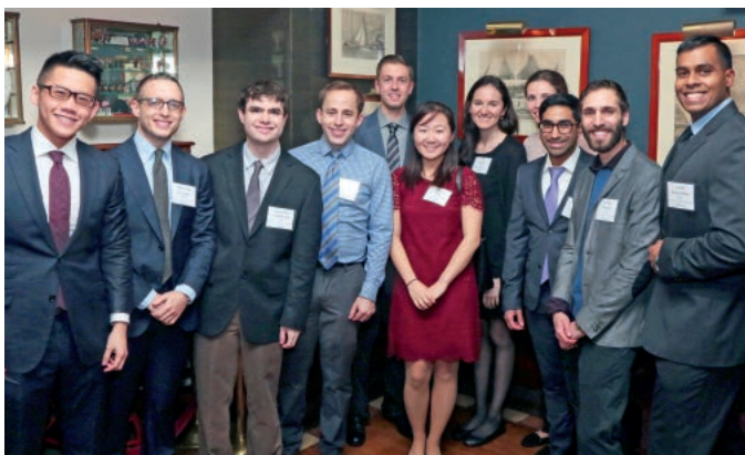
Eleven students, all scholarship recipients